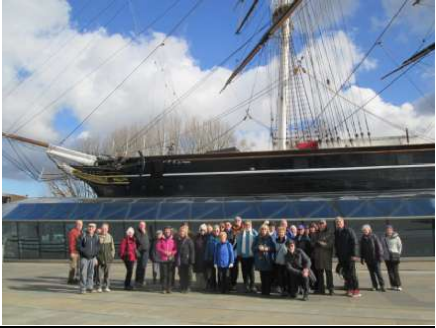
The Motley Crew