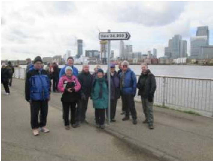
We seem to have lost the other 24,830